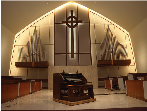
1959 III/59 Austin, First Presbyterian Church, Allentown