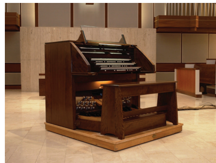
1959 III/59 Austin, First Presbyterian Church, Allentown