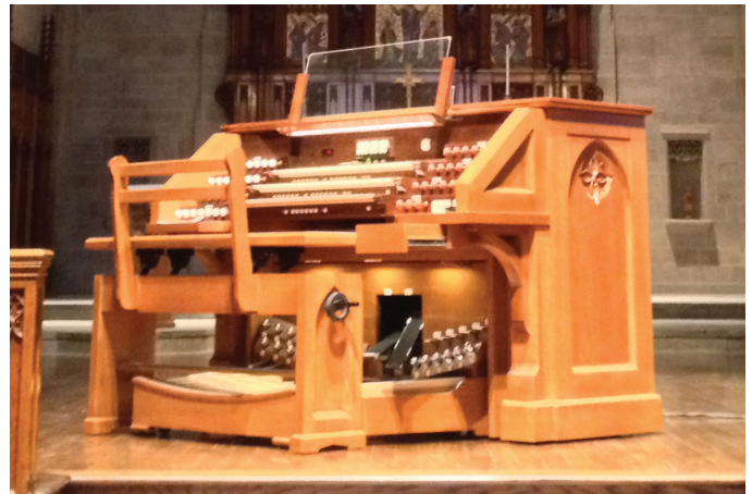
Berghaus console at Egner Chapel