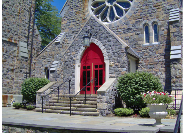
Cathedral Church of the Nativity