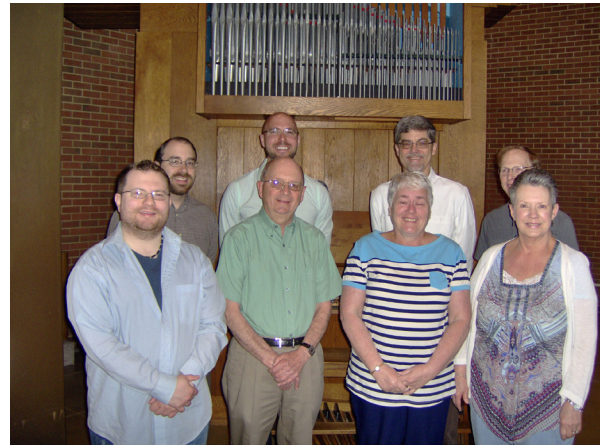
April Organ Crawl Participants

Benefits: Book/music allowance, secretarial assistance, music library assistance